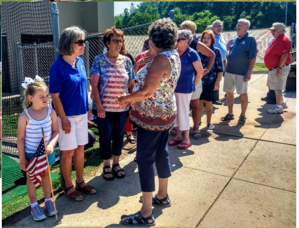
Grace Notes Handbell and Handchime choir (top) and Grace Sanctuary Choir performing for the Champion City Kings