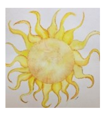
See you at the Fair!

Answer: As a child of God, I am to let my light shine – by using my Spiritual Gifts in ministry to God.